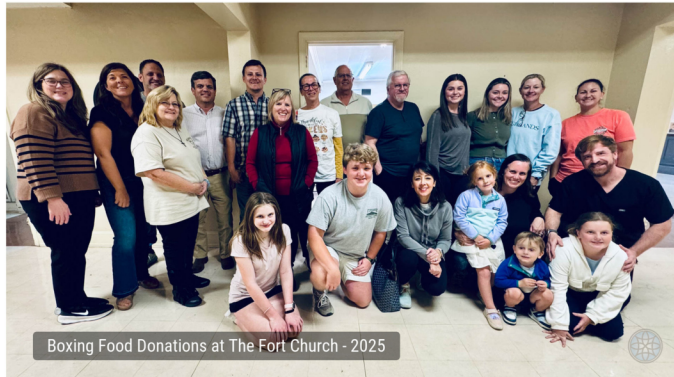
Boxing Food Donations at The Fort Church - 2025