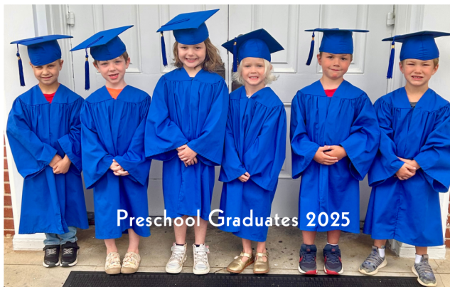
Preschool Graduates 2025